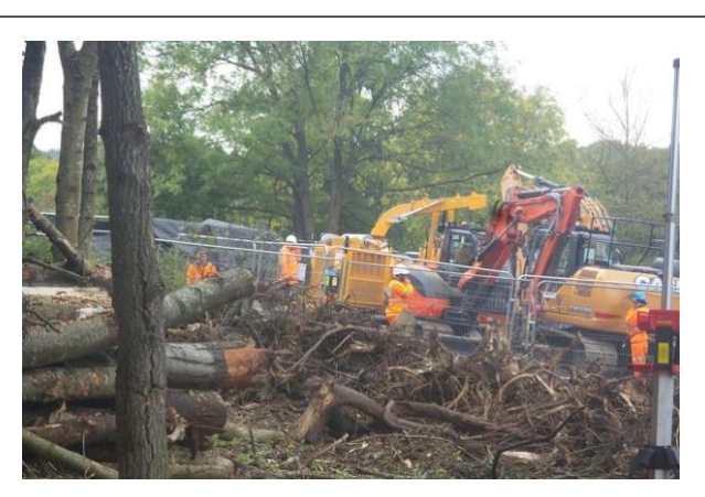
Woodland destruction in Ruislip, north west London.

This is not the opinion of everyone. Many people have protested against this catastrophic build because it will destroy many green areas along